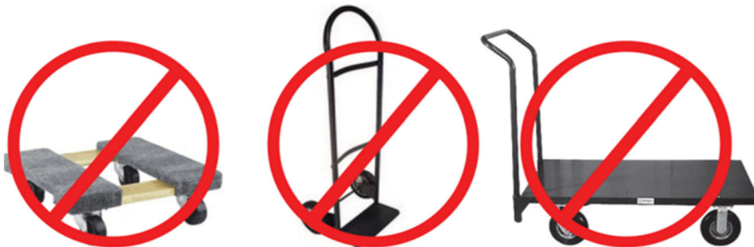
Four wheel push carts